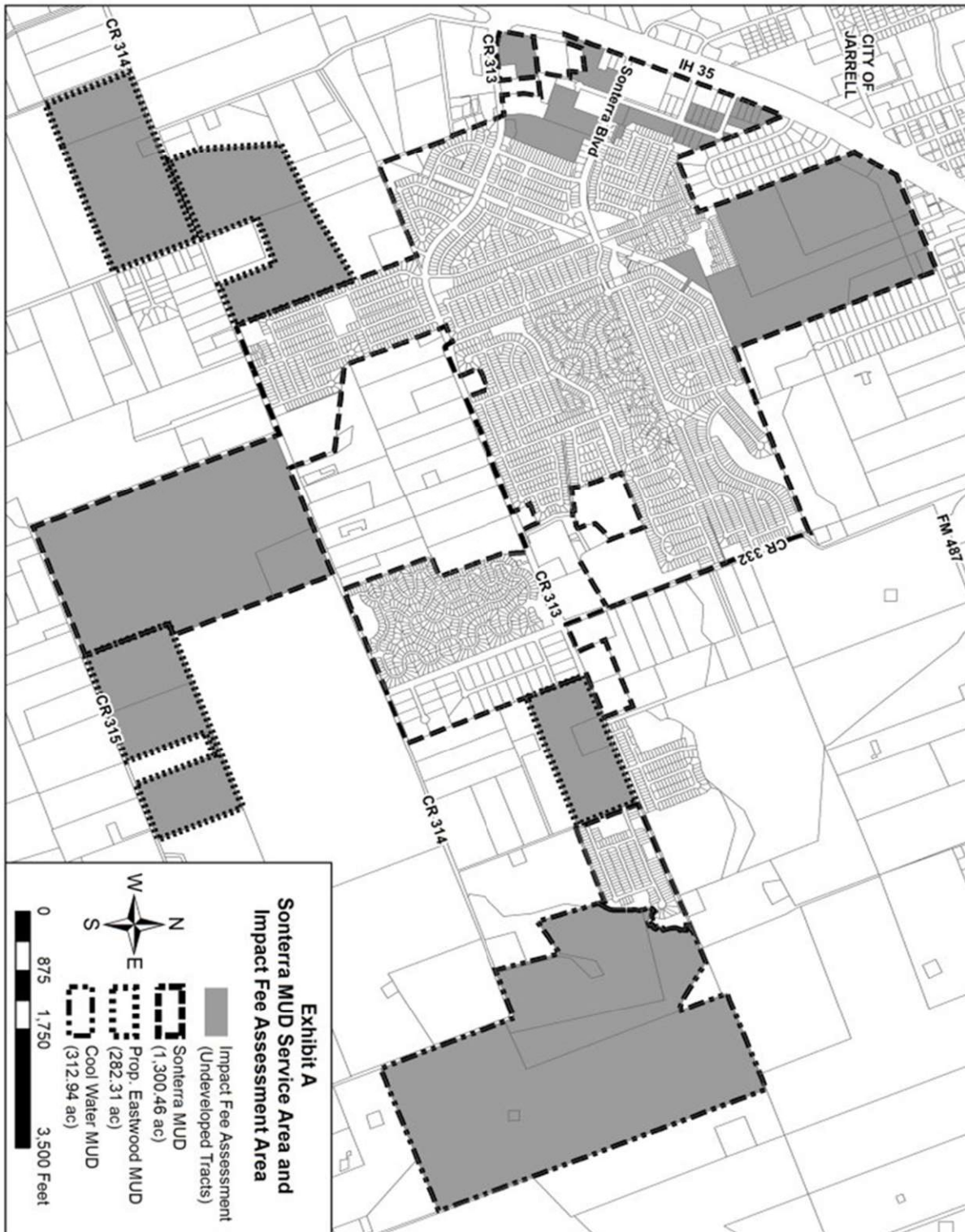
EXHIBIT "A" SERVICE AREA